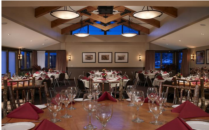
Columbine Room, The Stonebridge Inn