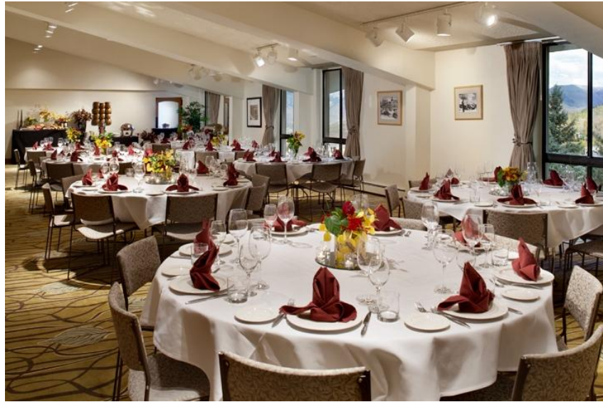
Council Room, The Stonebridge Inn

All food and beverage prices are subject to a 20% service charge and sales tax of 10.4% Prices and menu items are subject to change without notice