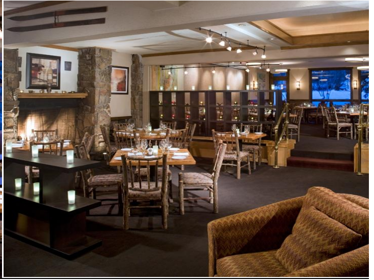
Artisan Restaurant, The Stonebridge Inn