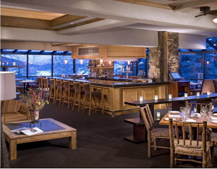
Artisan Bar, The Stonebridge Inn